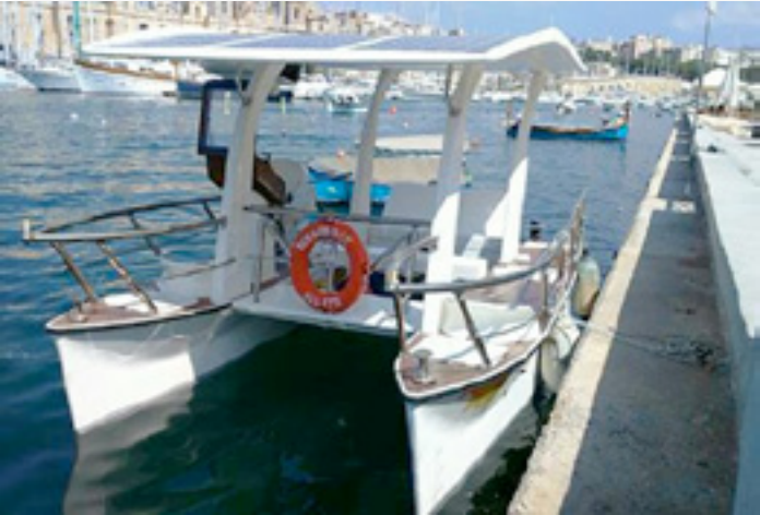
CARMEL AZZOPARDI Modelling in GRP Material and Wood

Boat Building - Solar Catamaran named 'Karmdile'