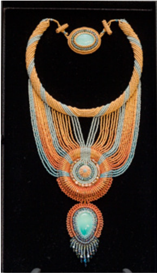
JOANNE ZAMMIT Beading