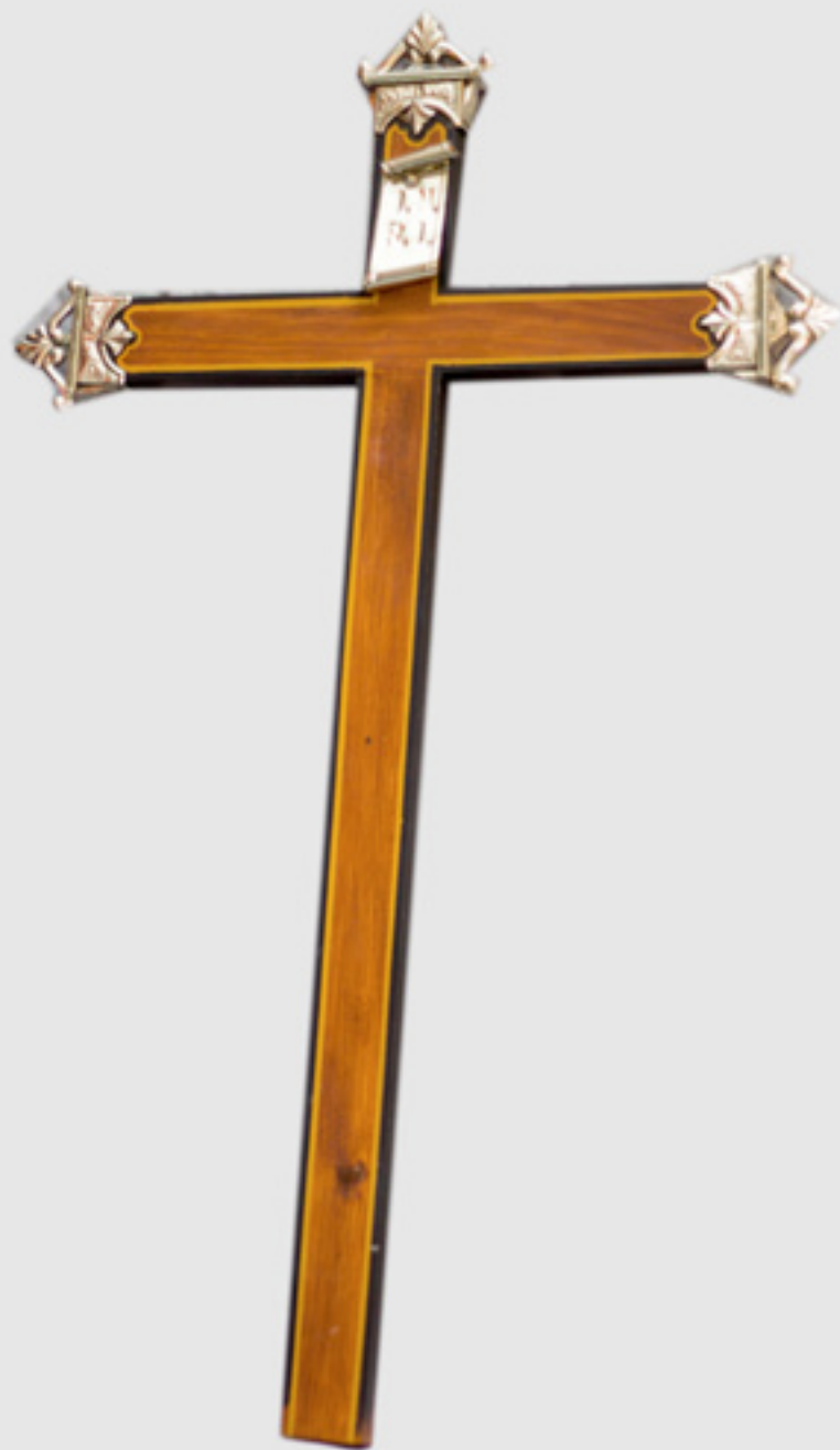
JOSEPH SALIBA Silver Works