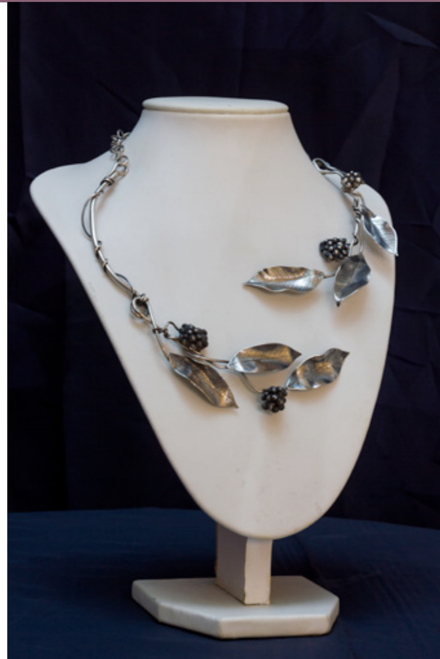
RACHEL ROBINSON Silver Works