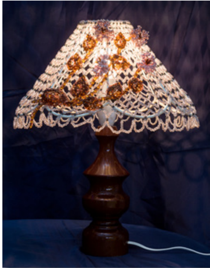
DEBORAH LIA Beading