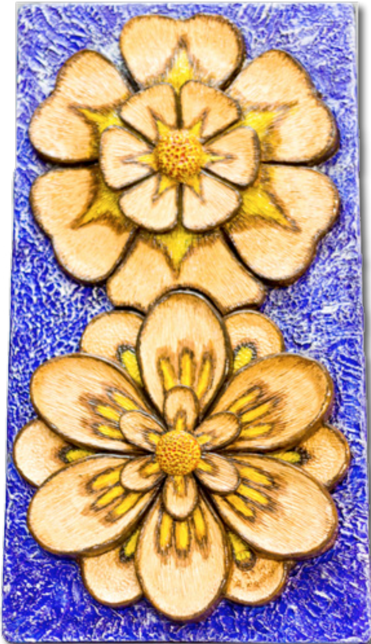
ALFRED AQUILINA Ceramics