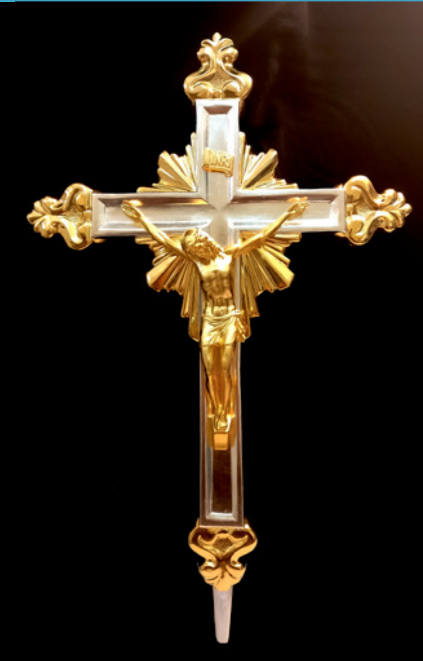
CONRAD ATTARD Gilding