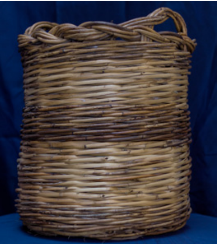
JOHN MIFSUD Cane Works

Boat Building - Solar Catamaran named 'Karmdile'